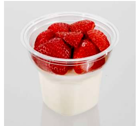
Small and large Parfait cups are available with a common insert and lid

Designed for popular grab and go snacking occasions.