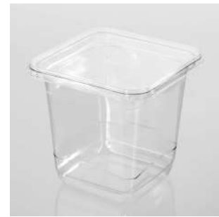
NEW! 48 oz. square