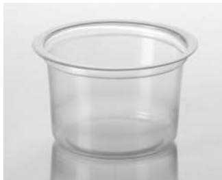
NEW! 15 oz. microwavable container