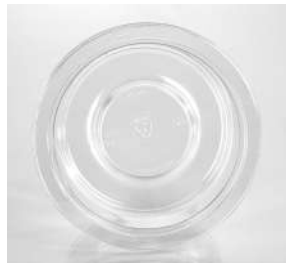
Easy to seal wide rim