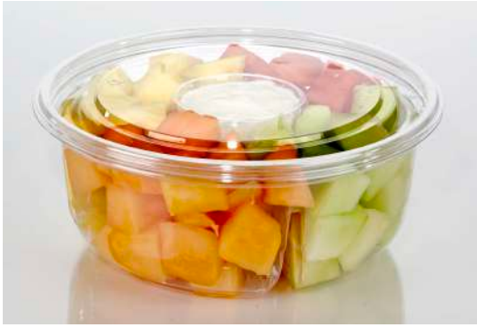
NEW! Traditional Round Bowl